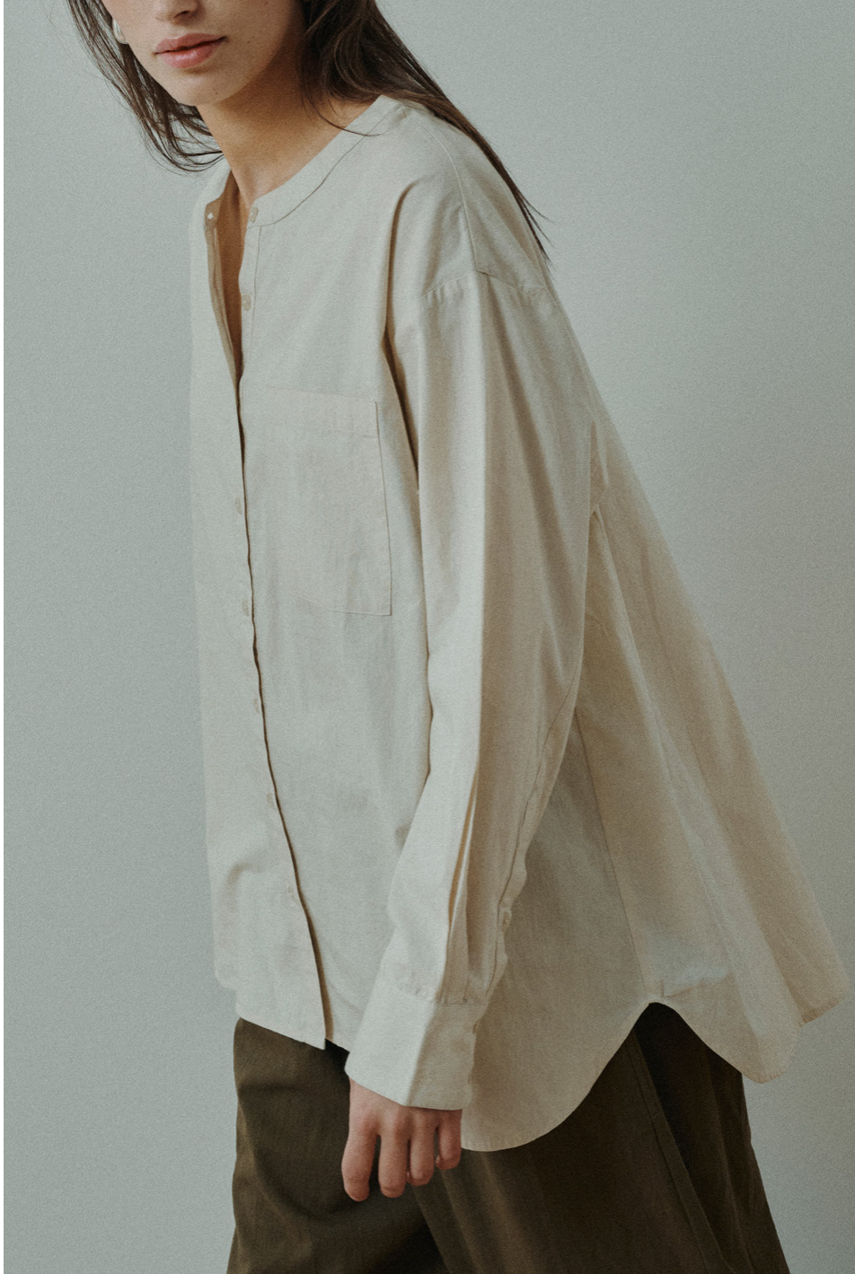
Irissa os shirt | C25AW0021 Flora hw barrel pant | C25AW0013