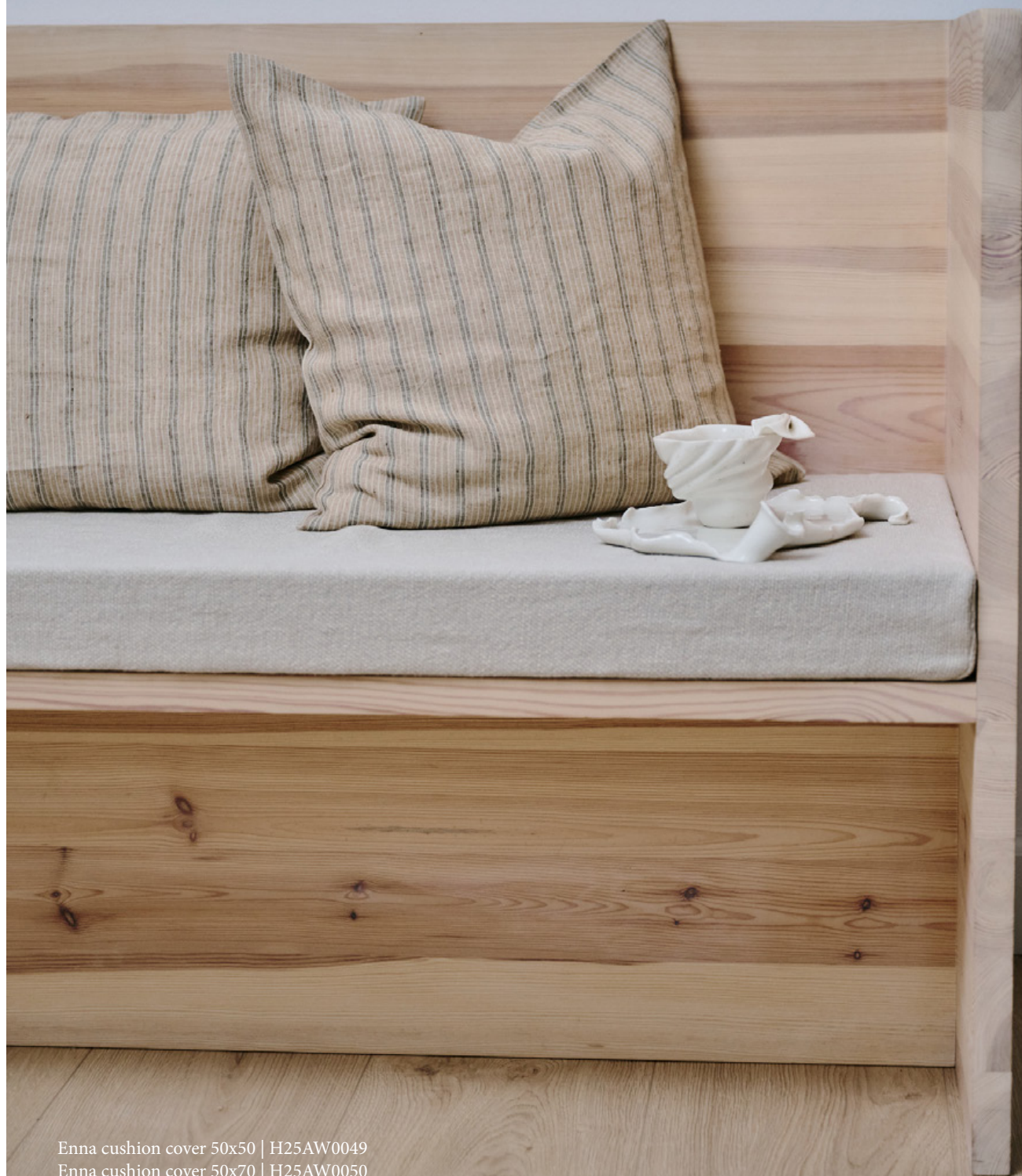
Enna cushion cover 50x50 | H25AW0049 Enna cushion cover 50x70 | H25AW0050