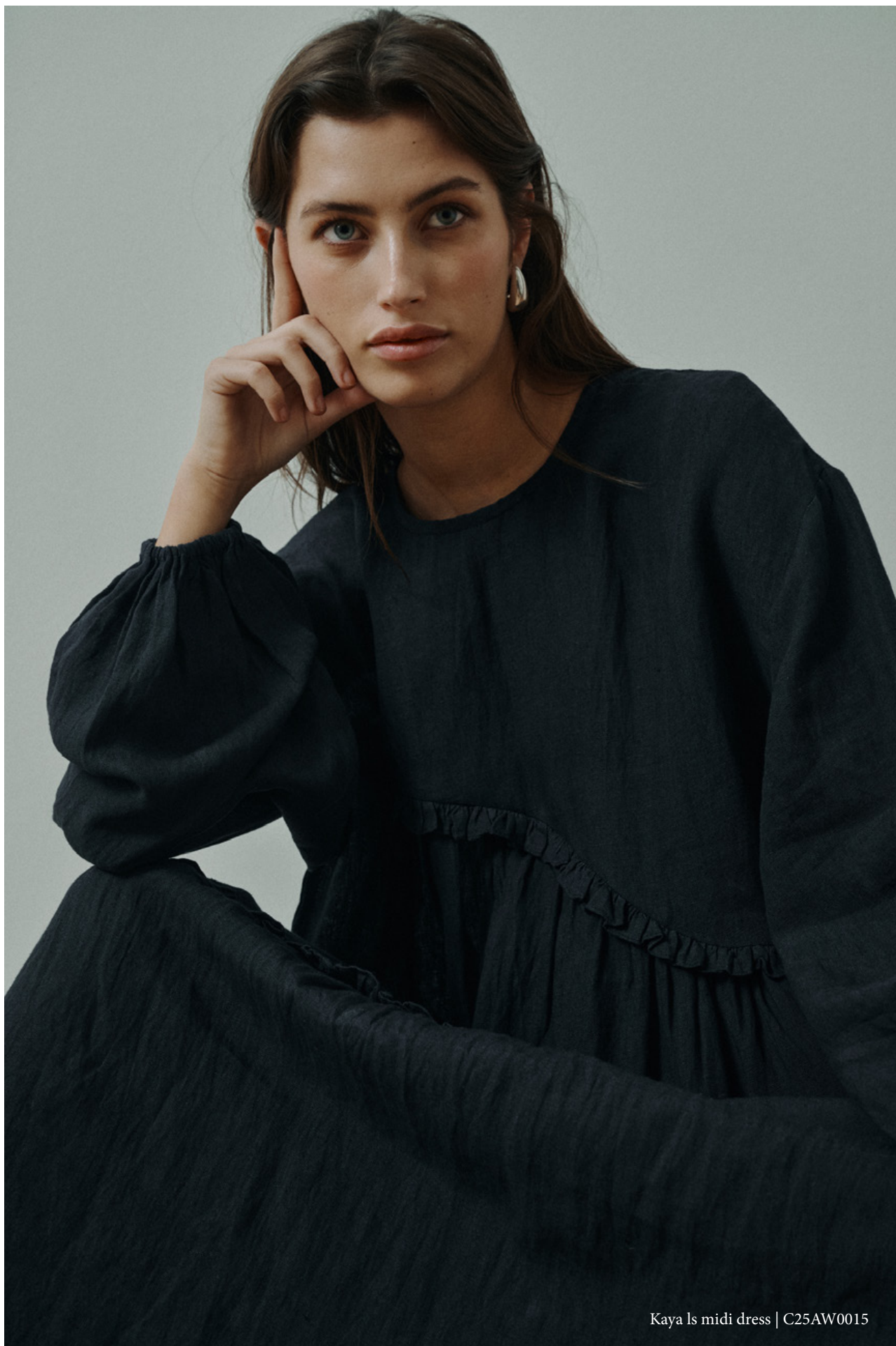
Kaya ls midi dress | C25AW0015