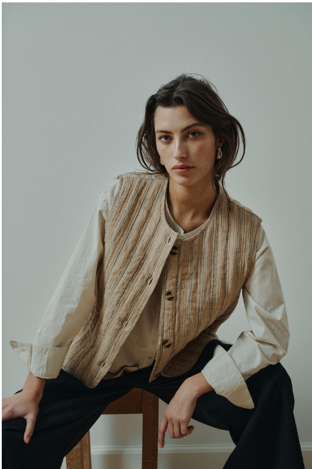
Irissa os shirt | C25AW0021 Flora hw barrel pant | C25AW0012 Sienna waistcoat | C25AW0030