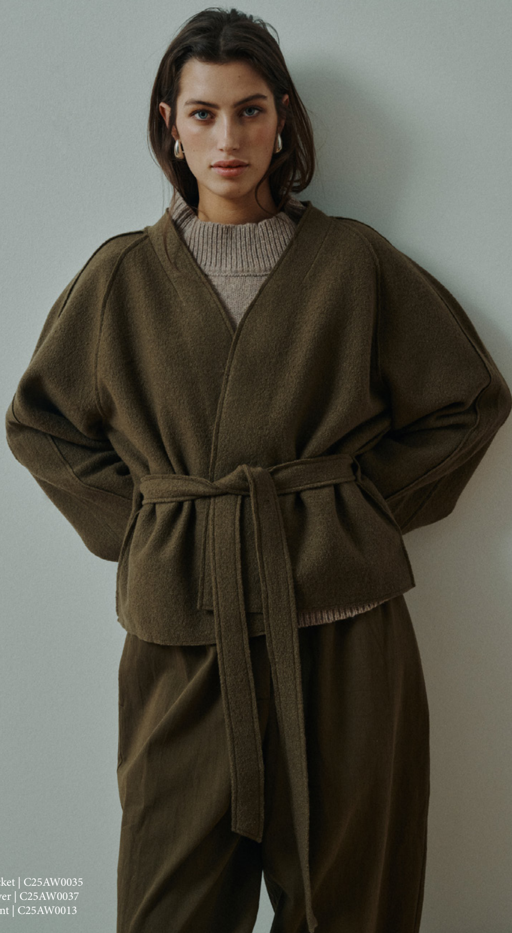
Ea raglan short jacket | C25AW0035 Silje knitted pullover | C25AW0037 Flora hw barrel pant | C25AW0013