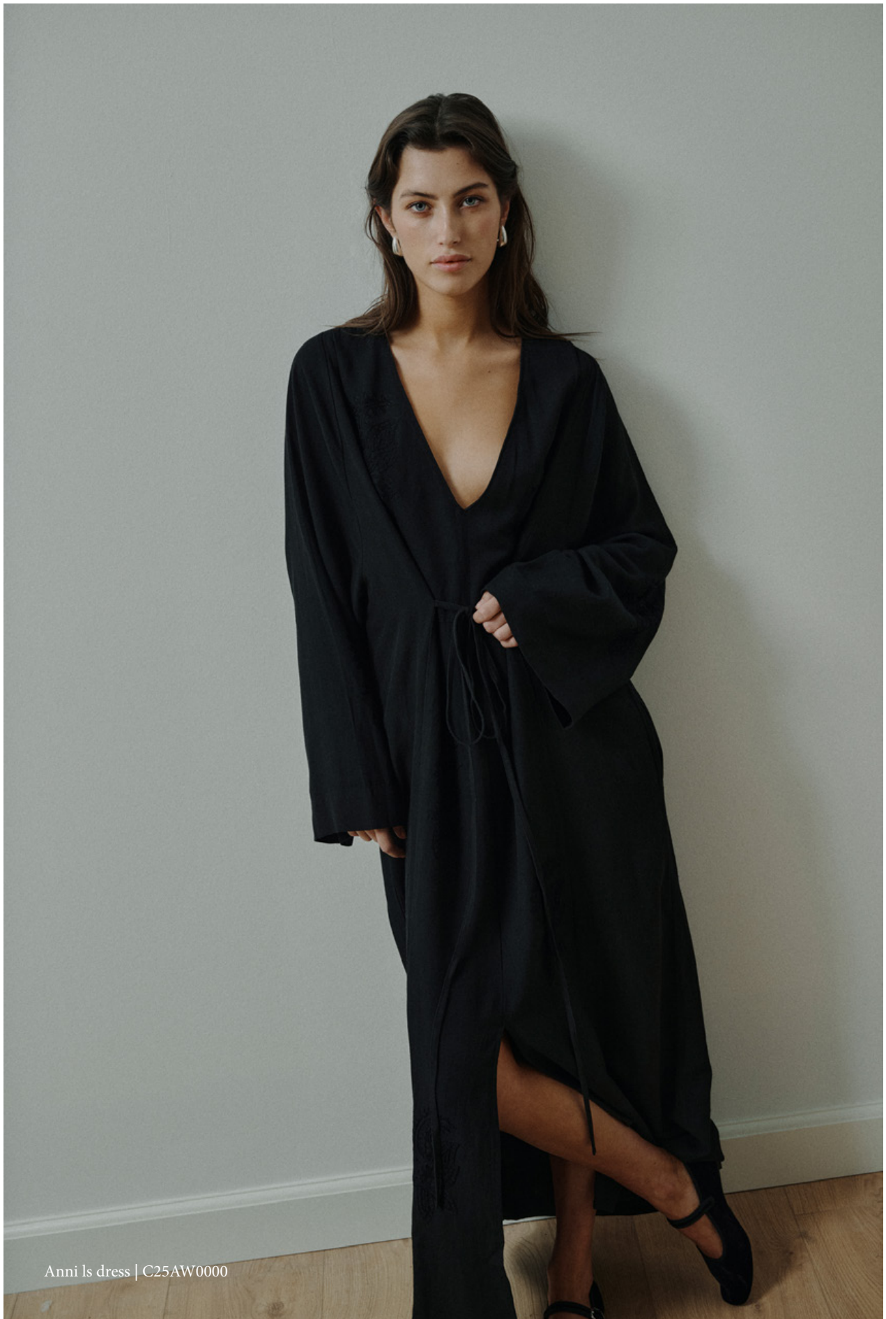
Anni ls dress | C25AW0000