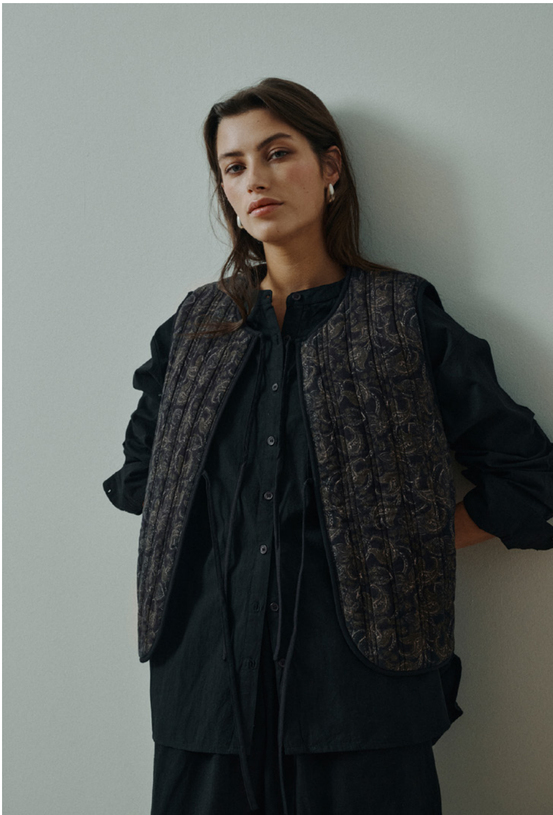
Chloe quilt waistcoat | C25AW0006 Irissa os shirt | C25AW0022 Flora hw barrel pant | C25AW0012