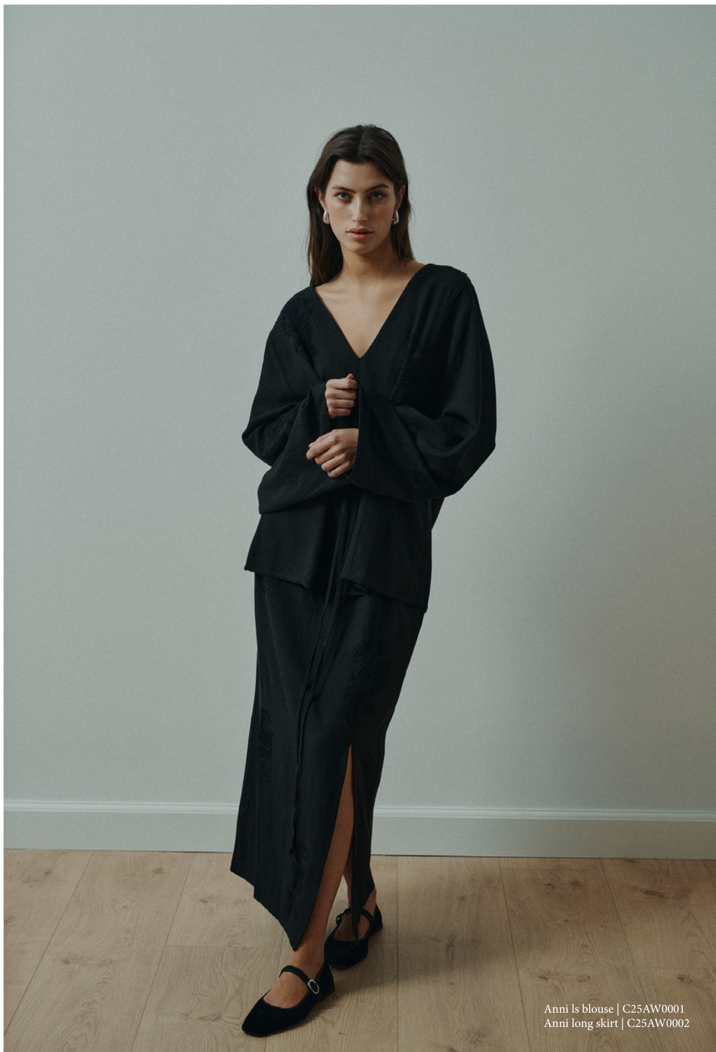
Anni ls blouse | C25AW0001 Anni long skirt | C25AW0002