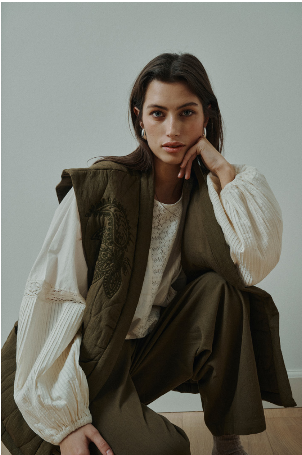
Jasmin ls blouse | C25AW0068 Calby waistcoat | C25AW0025 Flora hw barrel pant | C25AW0013