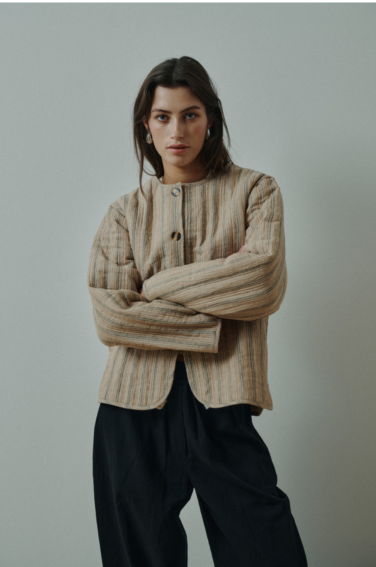
Sienna ls jacket | C25AW0031 Flora hw barrel pant | C25AW0012