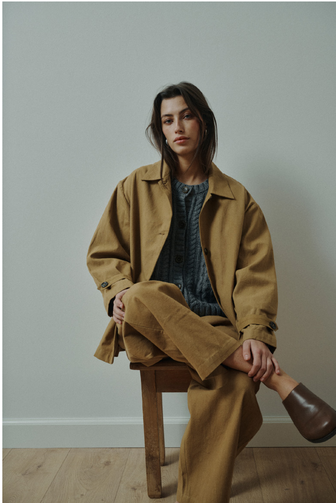
Dahlia ls knit cardigan | C25AW0073 Vera mw barrel pant | C25AW0018 Vera short jacket | C25AW0016