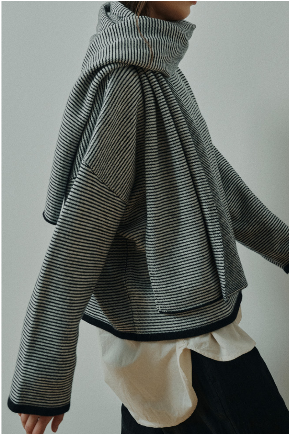
Irissa os shirt | C25AW0021 Aya knitted pullover | C25AW0033 Flora hw barrel pant | C25AW012 Aya knitted scarf | C25AW0032