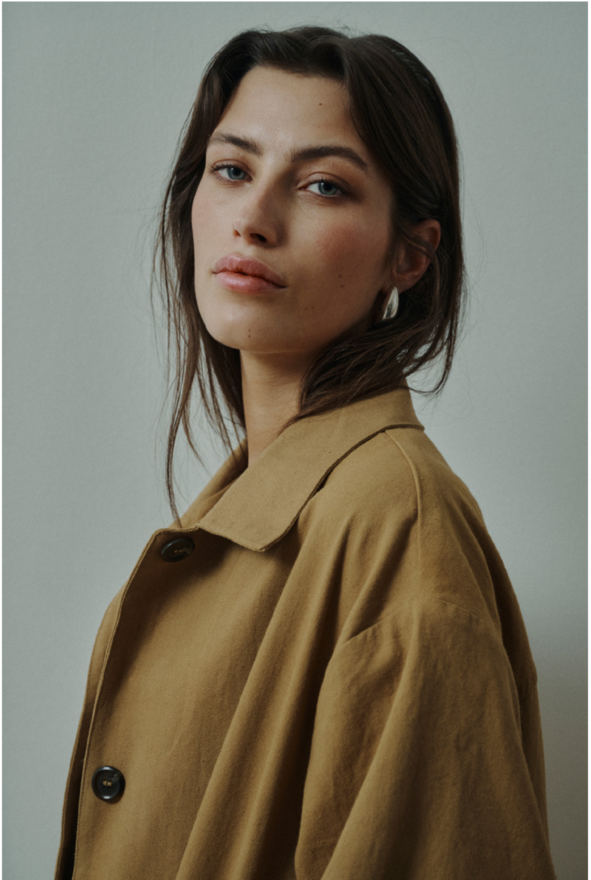
Vera trenchcoat | C25AW0017