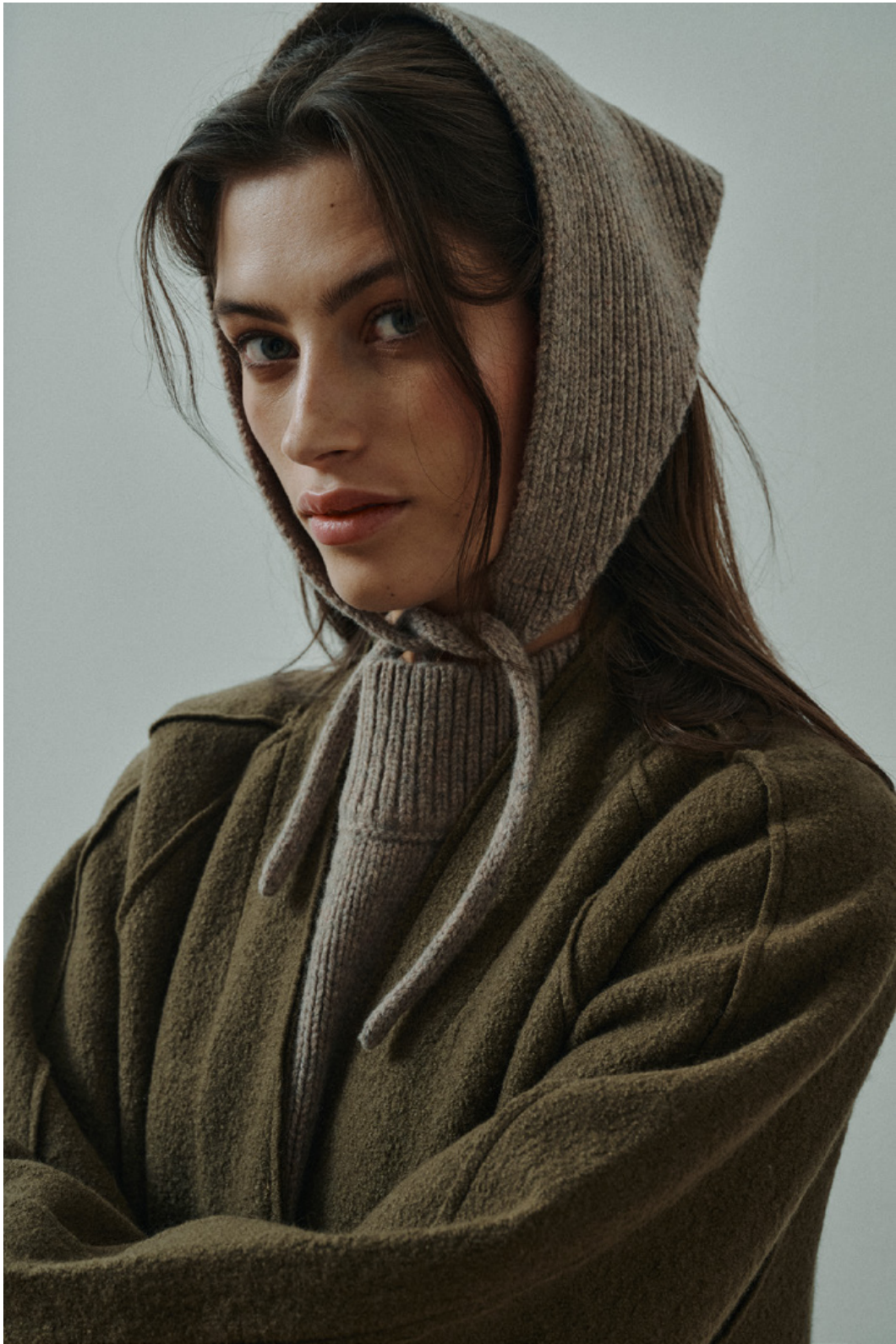
Silje knitted triangle scarf | C25AW0041 Ea raglan cardigan | C25AW0034 Silje knitted pullover | C25AW0037