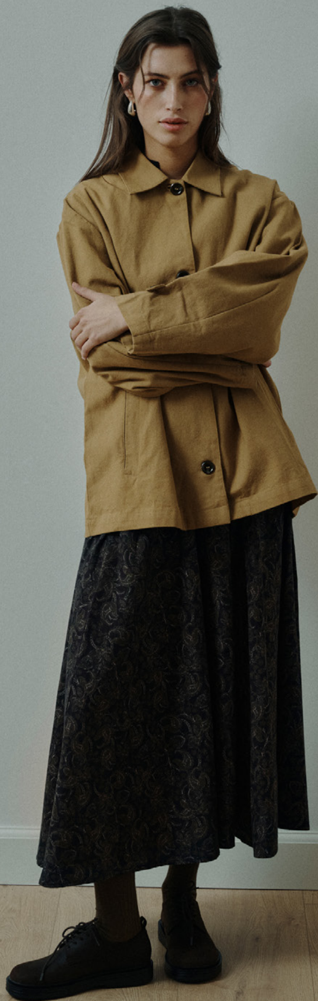
Vera short jacket | C25AW0016 Chloe midi skirt | C25AW0005