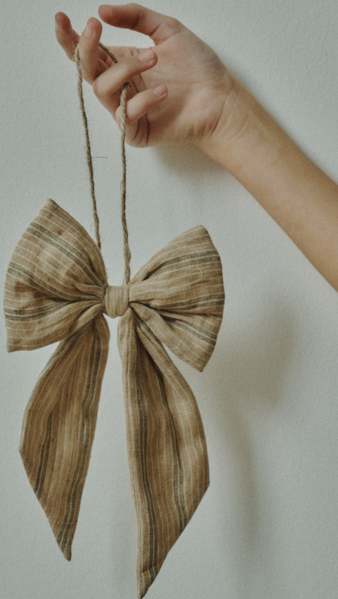
Enna bow large | H25AW0054