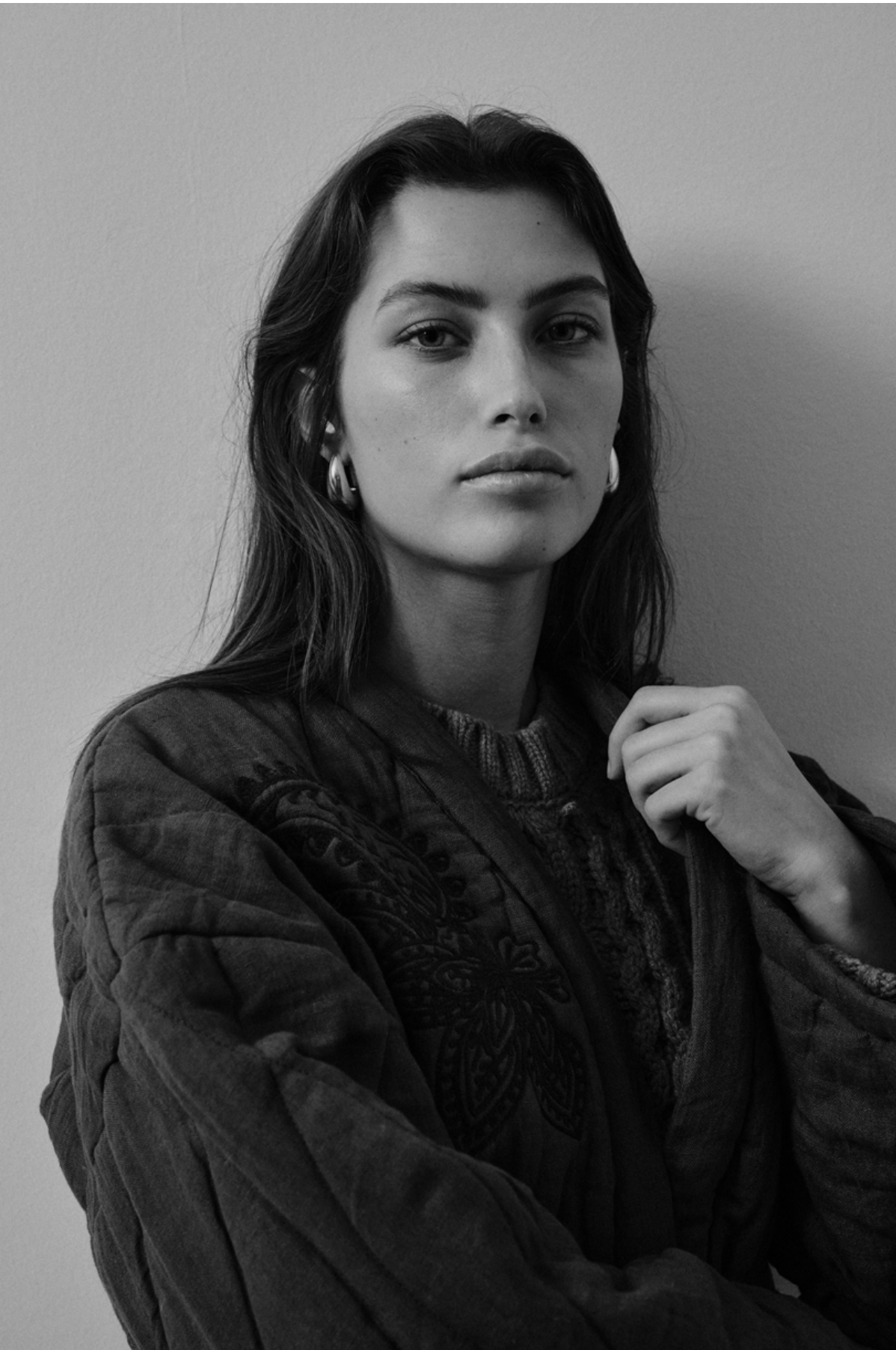
Calby jacket | C25AW0026 Dahlia ls knit pullover | C25AW0073