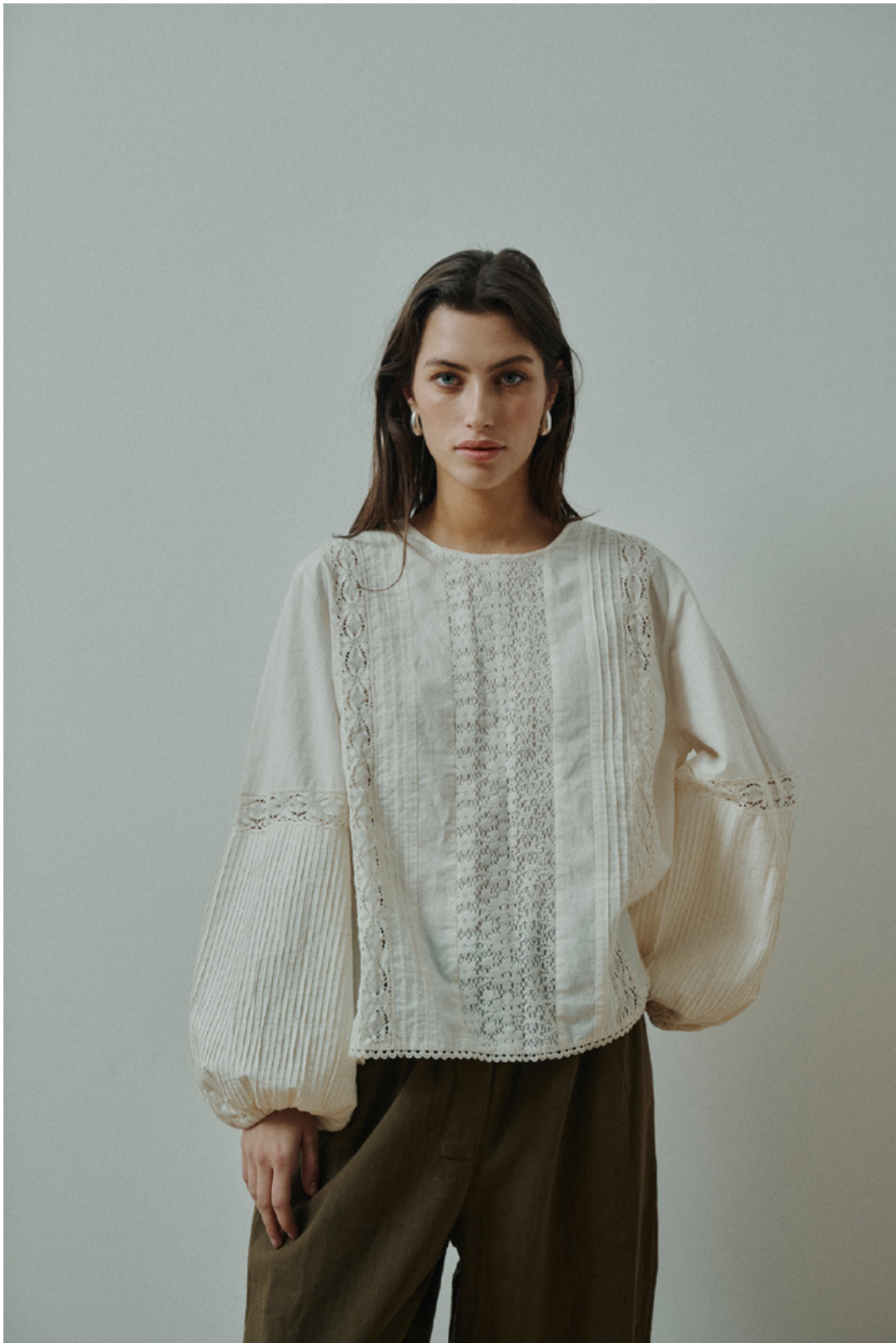
Jasmin ls blouse | C25AW0068 Flora hw barrel pant | C25AW0013