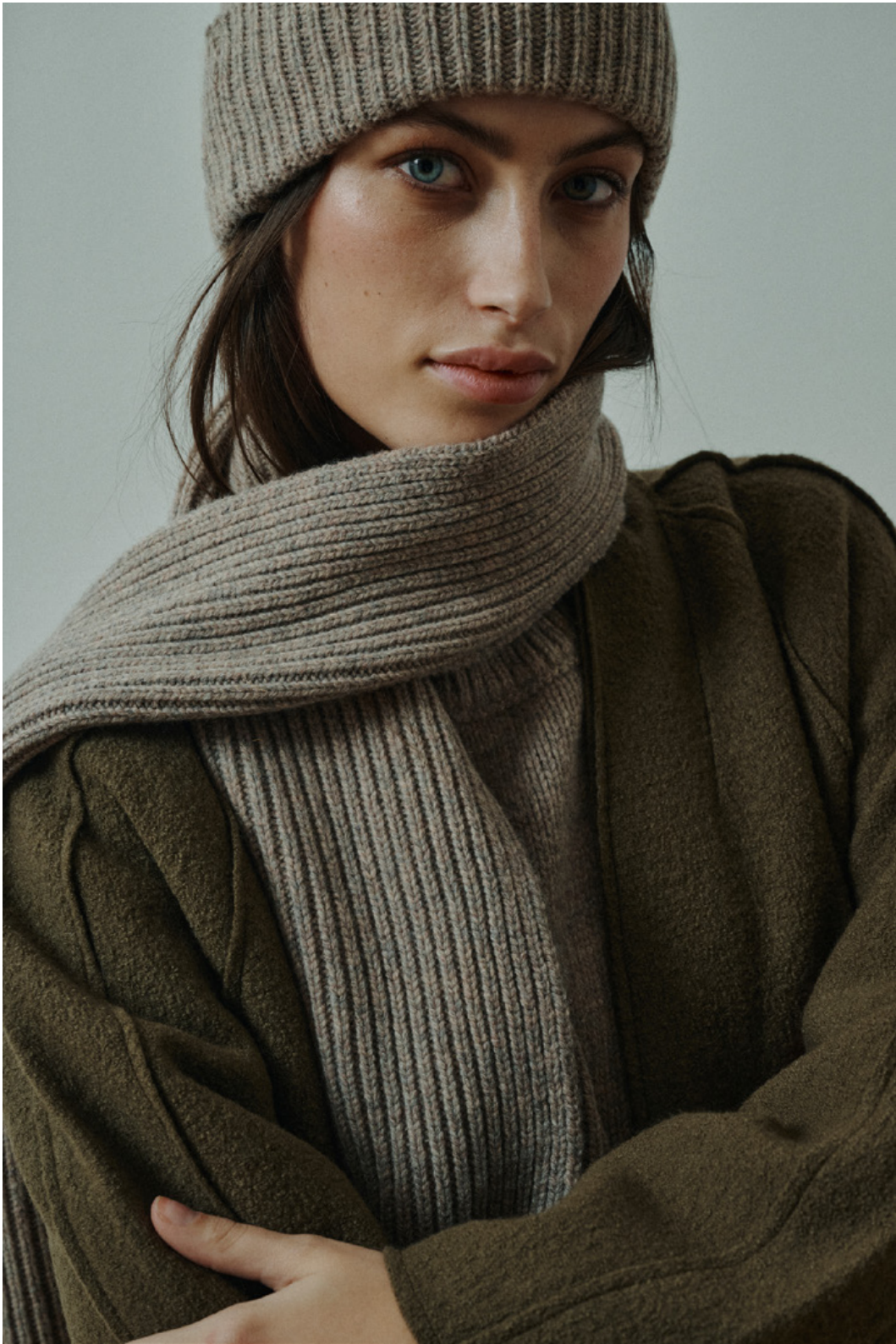
Ea raglan cardigan | C25AW0034 Silje knitted beanie | C25AW0042 Silje knitted scarf | C25AW0039