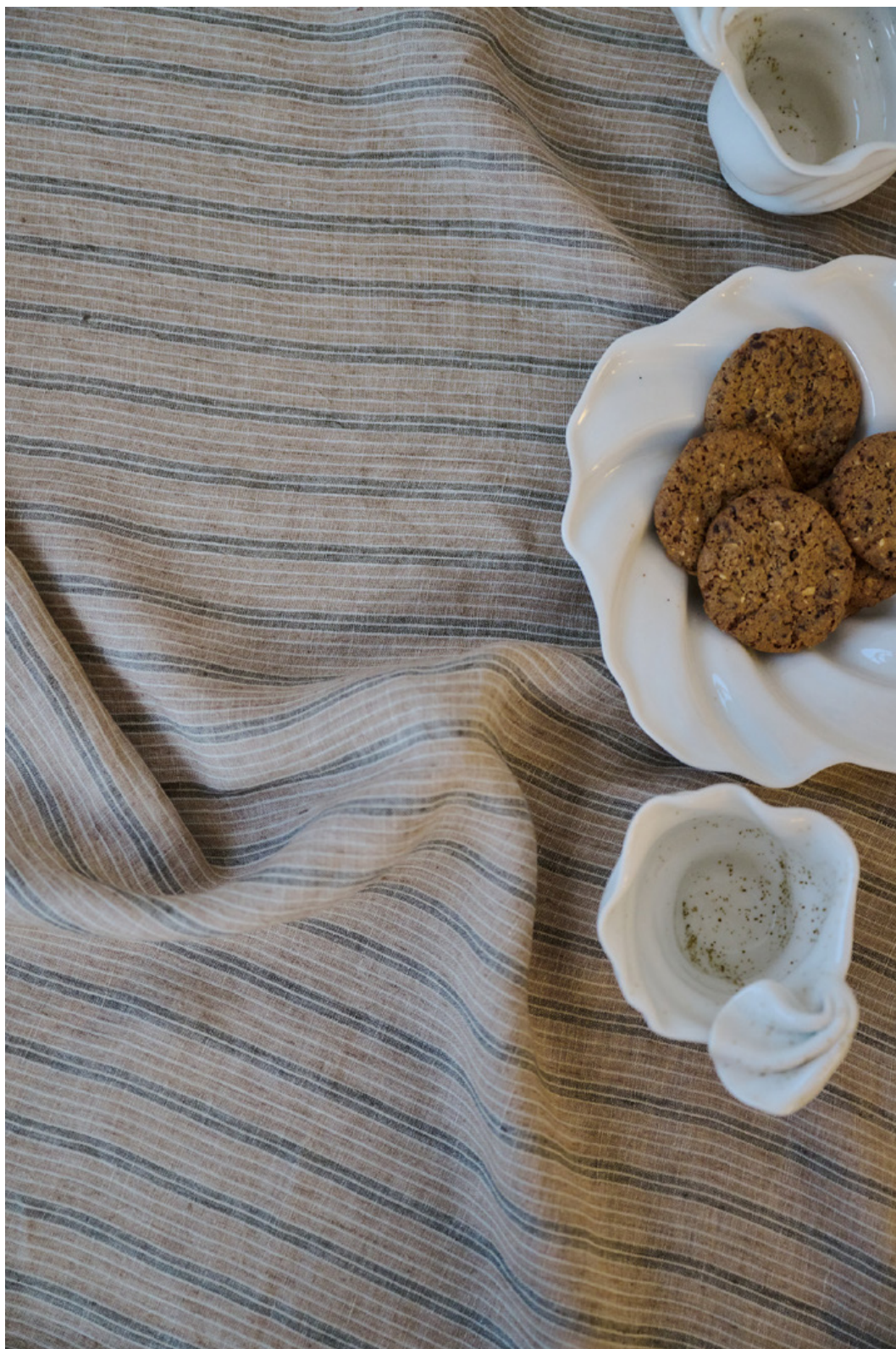
Enna tablecloth | H25AW0044